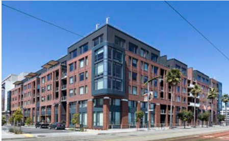
Mission Bay Block 2 & 3 San Francisco, CA

“Because you are a licensed geotechnical engineer, I can always count on your honest feedback and discussion regarding foundation solutions. With Farrell, we get a well-engineered solution that is reliable, appropriate, and will ultimately save our client time and money.”