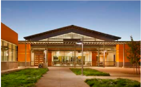
UC Davis Brewery/Winery and Food Pilot Facility Davis, CA

“The recycled concrete content in the system really made this a double win as we saved money for the project instead of using concrete drilled piers and we enhanced sustainability for the project.”