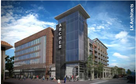
Archer Hotel Napa, CA