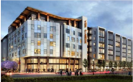
The Pierce San Jose, CA